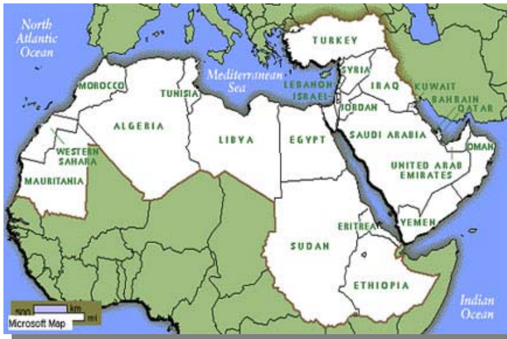
Lands of Semitic Peoples

“Criticism of Israel’s political aims no more makes one anti-Jewish than criticism of Burma’s political aims makes one anti-Buddhist.” – Bruce Ramsey, Seattle Times , 5/08/02