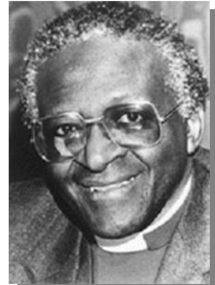
Bishop Tutu won the Nobel Peace Prize in the struggle against apartheid in S. Africa

For goodness sake, this is God's world! We live in a moral universe. The apartheid government was very powerful, but today no longer exists.” – Bishop Tutu , “ Apartheid in the Holy Land ,” The Guardian , 4/29/02